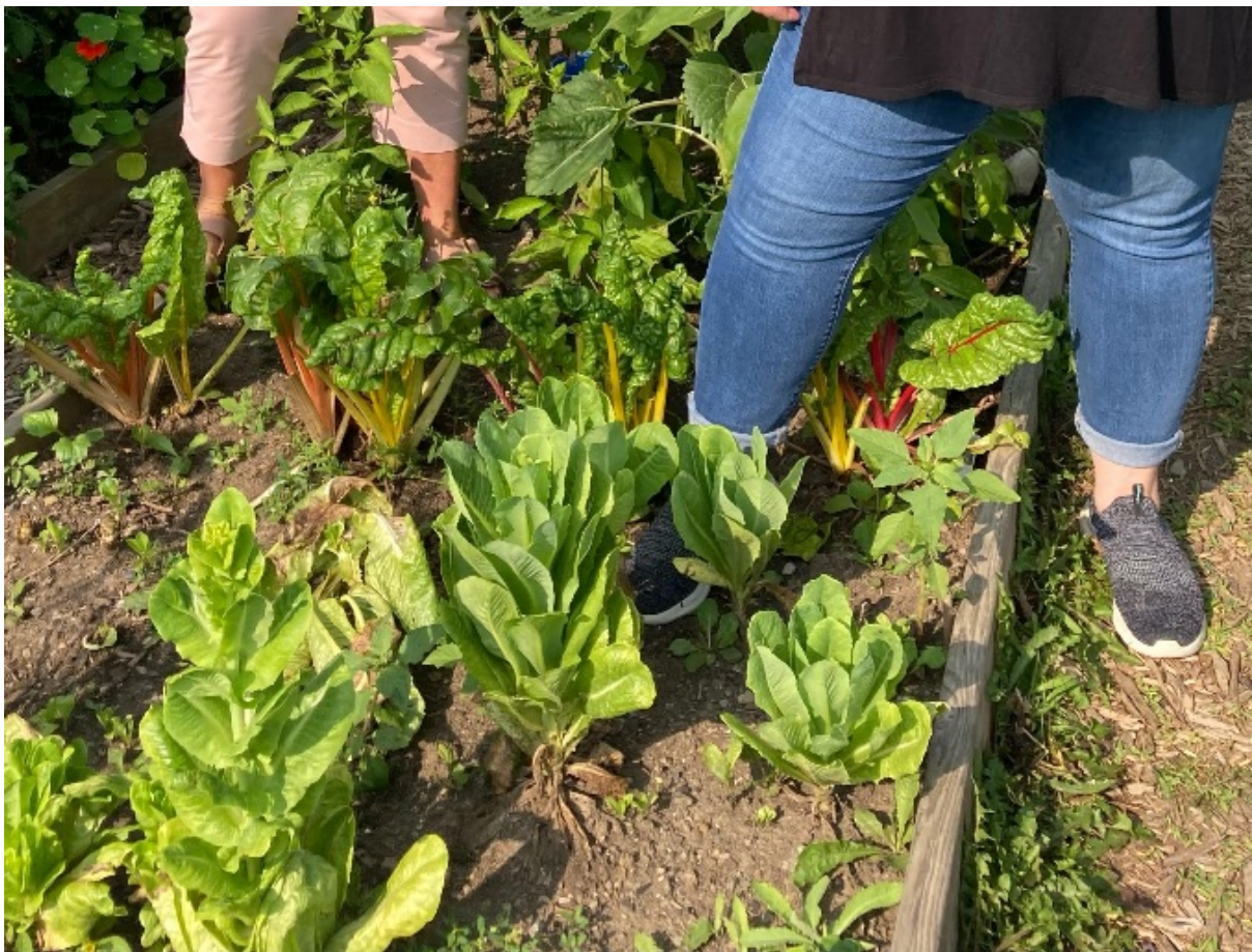
Kristy and Kim from the Blair Court Food Bank visiting the Trinity Community Garden, the allotment garden that provides garden fresh vegetables to their food bank