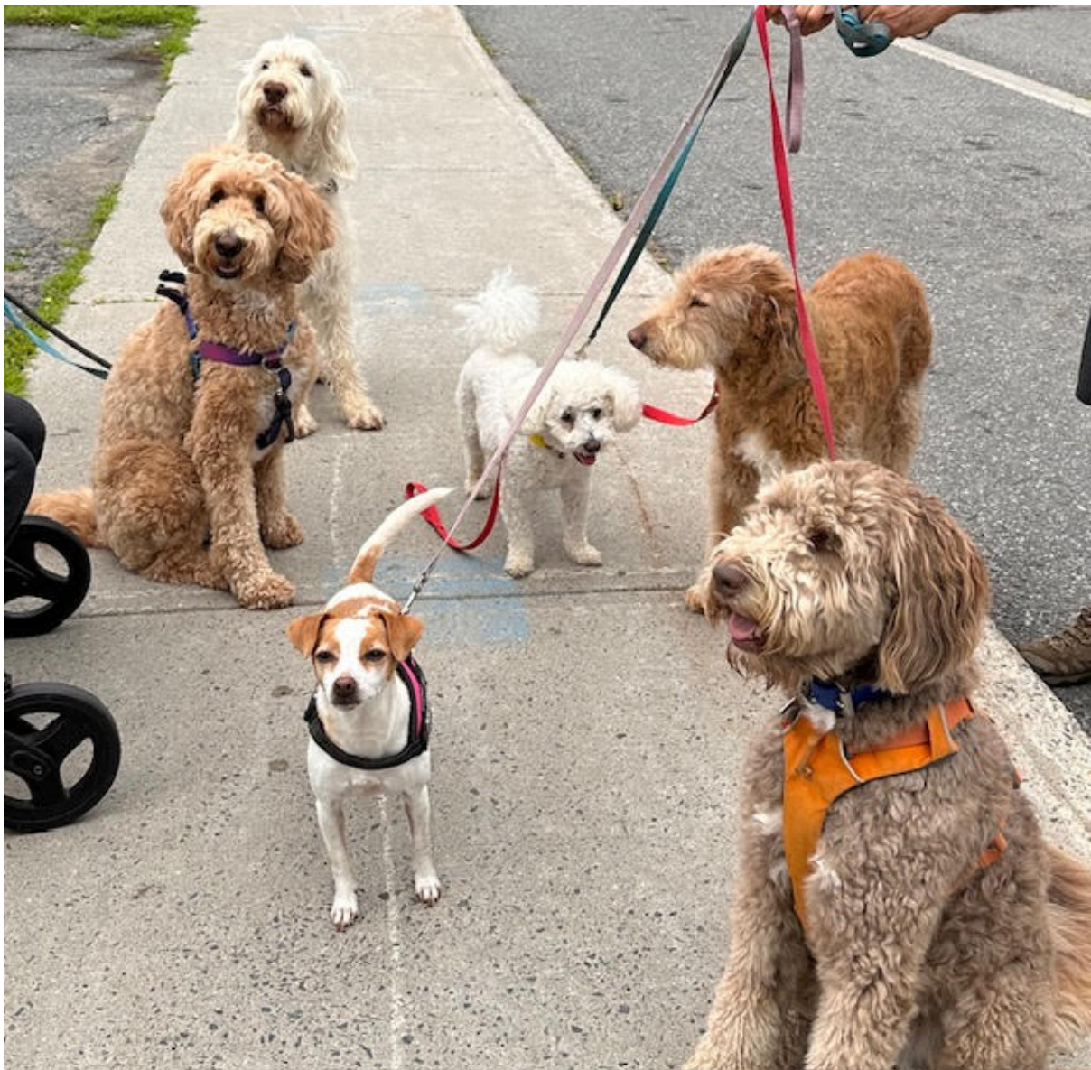
It's a Dog's Day in Riverview Park. From left to right: Jersey, Archie, Beasley, Teddy, Myla, and Marley.