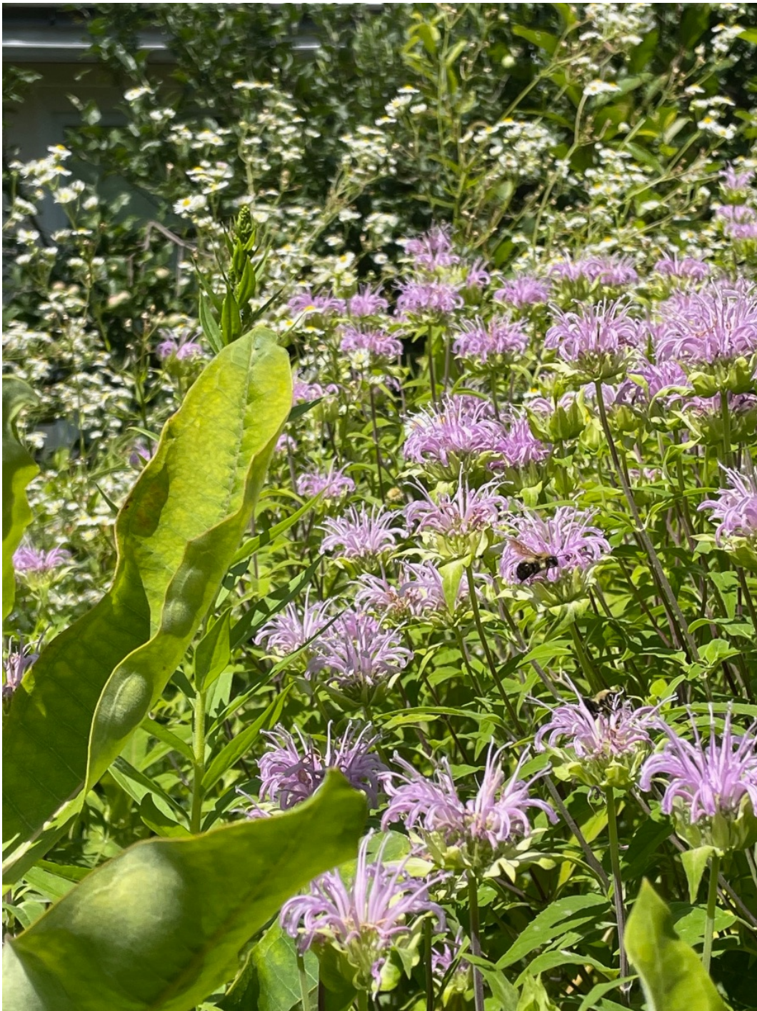
Monarda fistulosa and a pollinator