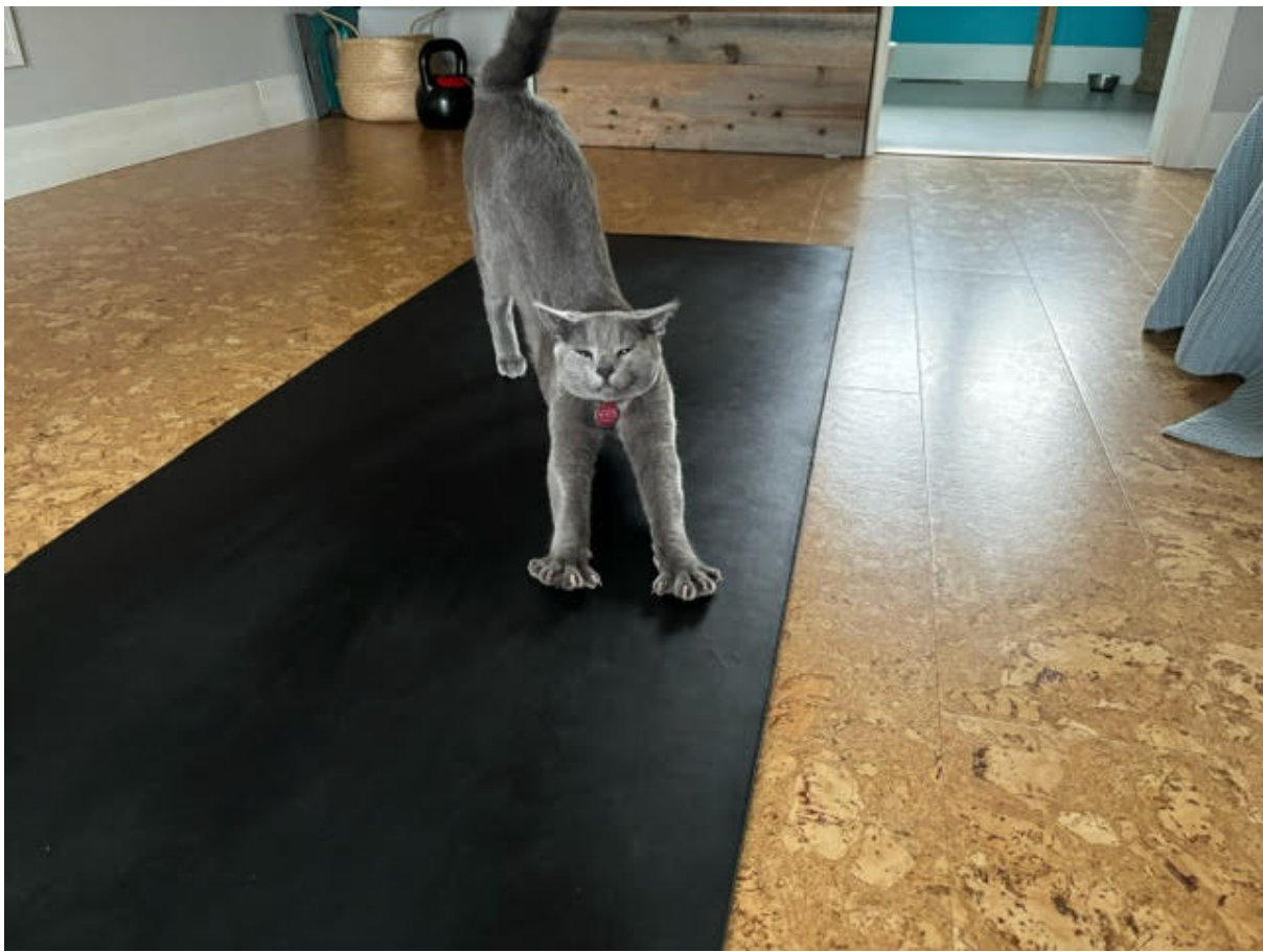
Nico, Cutest Cat Winner!